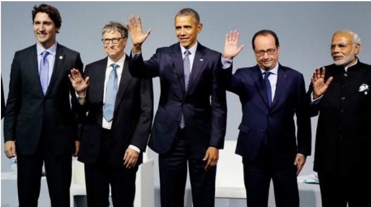
Canadian Prime Minister Justin Trudeau, Microsoft co-founder Bill